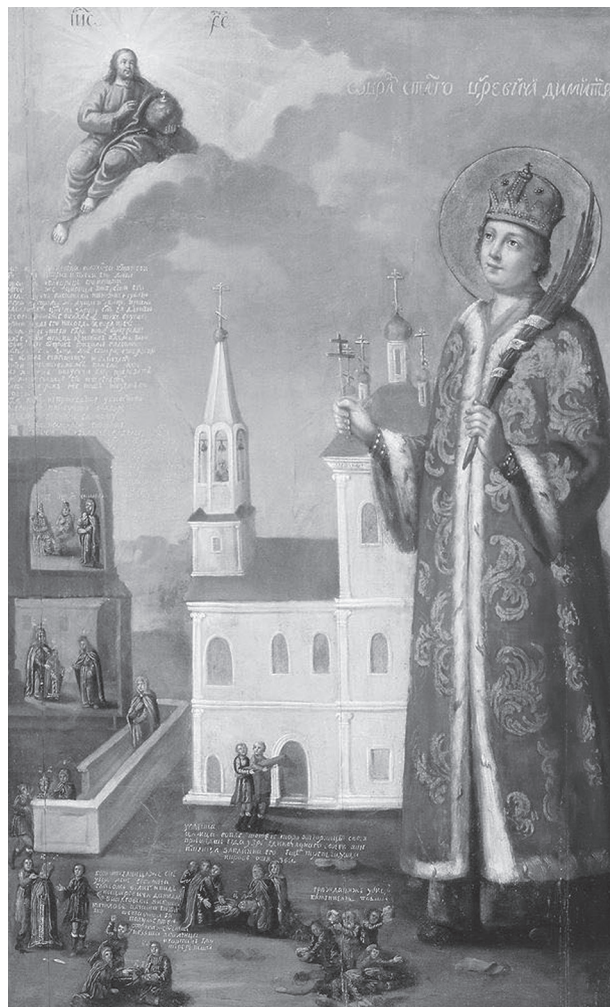
Fig. 1. Detail of Tsarevitch Dmitry Icon showing the sainted prince and the church of the Uglich (eighteenth century, in the collections of the State Museum of the History of Religion, Saint Petersburg).

pool of blood. As the bell tolled, rumors flew through the town that Boris Gudonov, the ambitious regent for Tsar Fyodor, had killed Dmitri in order to remove a potential rival to the throne. Riots followed, leading to the lynching of several local Gudonov agents. In the aftermath, a special commission concluded that the tsarevitch had stabbed himself when he suffered a seizure during a game. Gudonov exiled the leaders of the riots, but