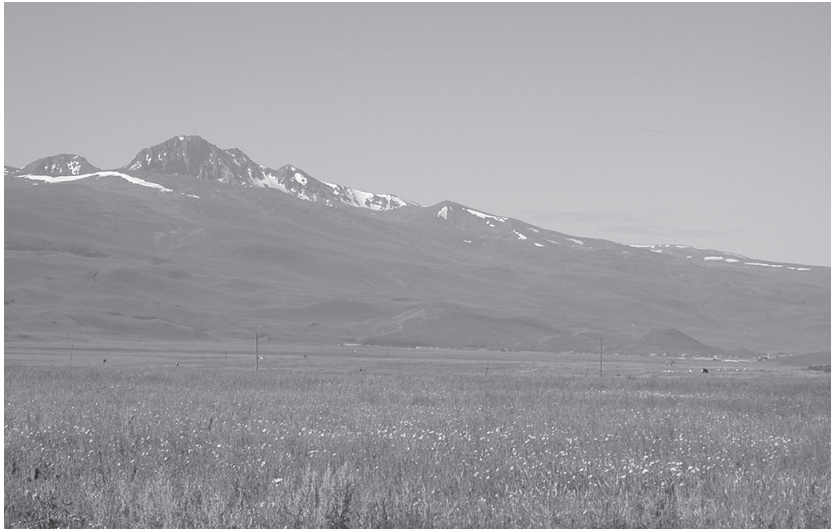
Fig. 3. Photo of the Tsaghkahovit Plain and the north slope of Mt. Aragats.

the capture and storing of snowmelt as the exploitation of river systems, since the latter tend to rest at the bottoms of deep gorges.